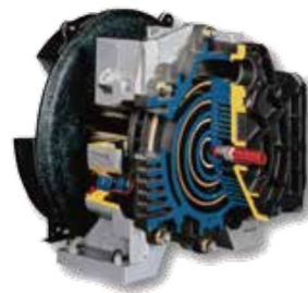
Pic 1 Airend Structure

SCR use a world-renowned scroll airend in the XA range for enhanced reliability. The compression chamber and lubricant system is 100% separated meaning there is no risk of oil contaminated air.